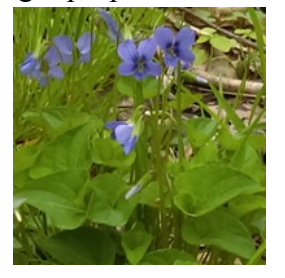
(continued on page 5)

the upper right is the northern bog violet (Viola nuphrophylla); and the small white one in the upper left is the Canadian violet (Viola Canadensis). The fifth (right) is the marsh blue violet (Viola cucullata) :