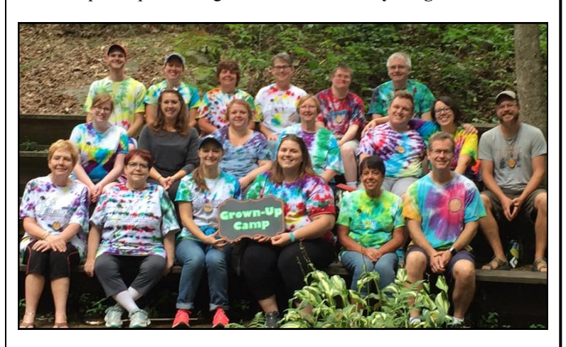
** In 2018 Grown-Up Campers will have the option to stay Friday - Sunday, Monday - Wednesday, or stay Friday - Wednesday!!!