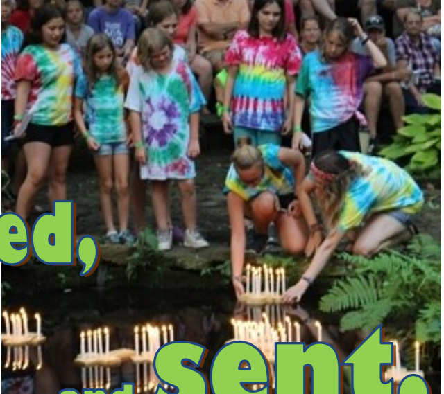
"My children came home so true to the people they are."