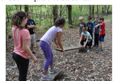
Students on a field trip working their way across the "Raging River" during group building as their teacher looks on.

As you can imagine, it takes quite a bit of planning to provide programs for 6,500 students. The LEEP staff is currently scheduling schools, repairing equipment, clearing trails, and otherwise preparing for 2018. We don't have much time to reflect on the success of 2017; we have reason to believe that 2018 will be just as extraordinary and even bigger!