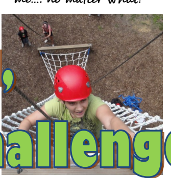
"The best thing about this week was how I connected with God."